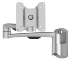
438-LC65 MONITOR ARM OSLO WITH WALL BRACKET, SILVER ARM LENGTH: 546 MM